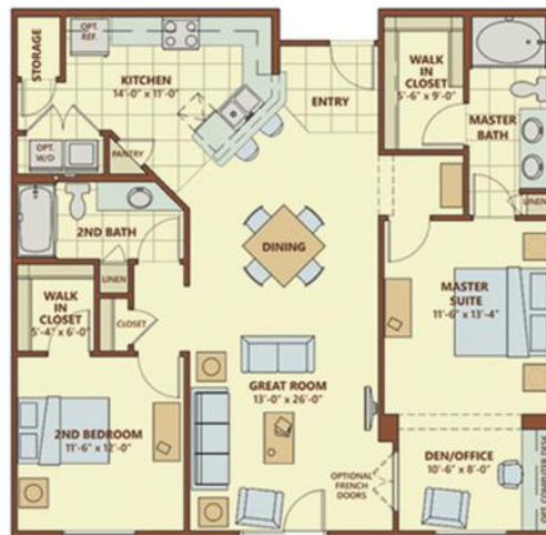
Montecito Floor Plan